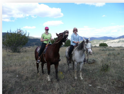
In the Rockies